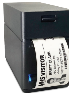
Seiko SLP 720RT