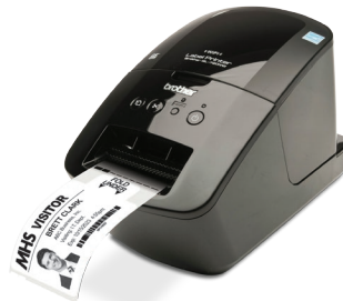
Brother QL Series

For more information check with printer manufacturer.