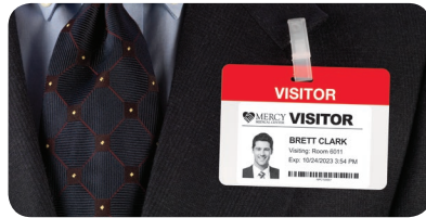
With Clip-On Back Piece*

* Specify the color of your Clip-On Back Piece: with "VISITOR" (red, gray, green, orange, pink, purple or blue) or without (red, green, or white)