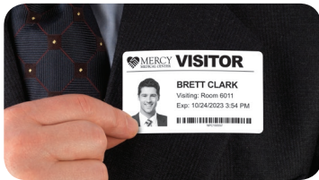
With Self-Adhesive Back Piece

Choose SELF ADHESIVE or CLIP-ON back pieces.